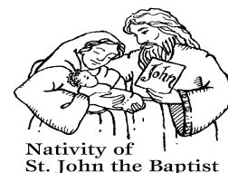
Nativity of St. John the Baptist